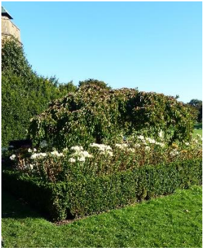
1. Weeping Cherry Prunus pendula . Bright pink flowers in spring.