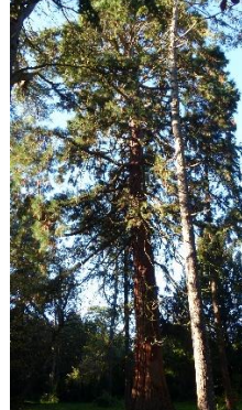
18. Giant Redwood Sequoiadendron giganteum . Planted in the Pinetum around 1850.