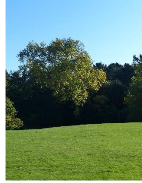
4. London Plane Platanus x hispanica . 7.45m girth, probably dates to 1700's.