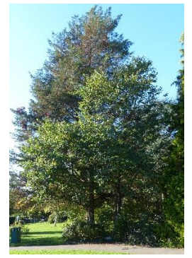
5. Judas Tree Cercis siliquastrum . Bright pink flowers in Spring.