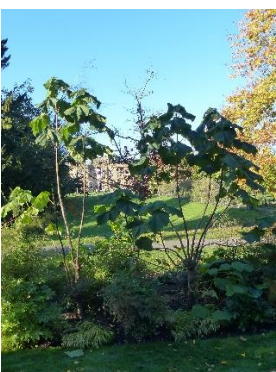
16. Foxglove Trees Paulownia tomentosa . Pruned annually to produce spectacular large leaves.