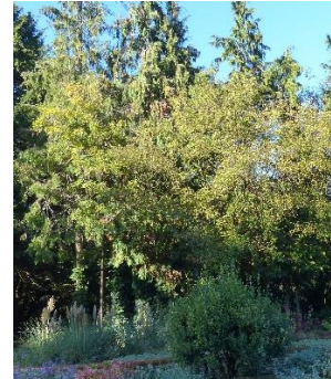
14. Laburnum Laburnum anagyroides . Bright yellow flowers in Spring.