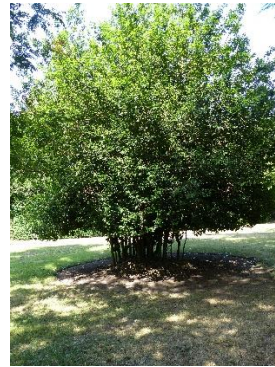
9. Holly Ilex aquifolium . Multi-stemmed specimen.