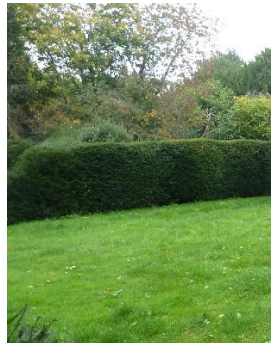
11. Yew Trees Taxus baccata . Hedges cut to form a "Yew Room".