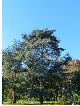
3. Cedar of Lebanon Cedrus Libani . Several large specimens around the Mansion House.