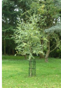
8. Silver Birch Betula pendula . Grown by the Nonsuch Voles from seed in 2010.