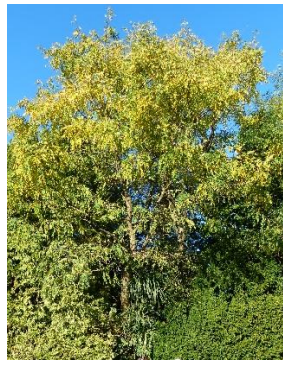
2. False Acacia Robinia pseudoacacia . Native to USA where it is called Black Locust.