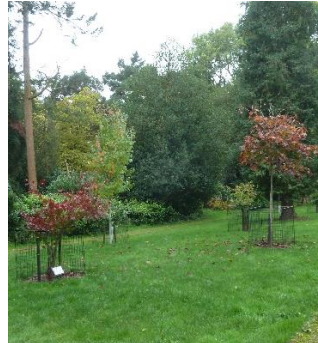
13. Acer Trees Various Acers planted in 2021.