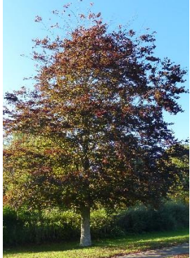
6. Copper Beech Fagus sylvatica f. Purpurea . Deep purple leaves.