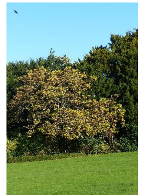
20. Indian Bean Tree Catalpa bignonioides . White Summer flowers, bean-like pods in Autumn.