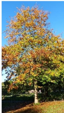
17. Red Oak Quercus rubra . Red Autumn foliage.