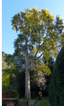
12. Ginkgo – male Ginkgo biloba . Large specimen.