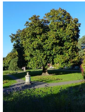
19. Magnolia Trees Magnolia grandiflora . Large white flowers.