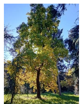
15. Tulip Tree Liriodendron tulipifera . Tulip-like flowers.