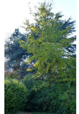
10. Ginkgo - female Ginkgo biloba . Yellow fruits in Autumn.