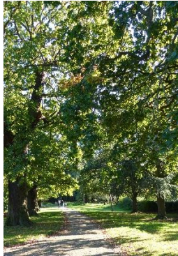
7. Oak Walk Quercus robur . A line of English oak trees.